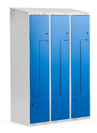
Clothes Z-locker, sloping roof