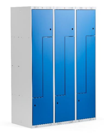
Clothes Z-locker, flat roof

This EPD applies to AJ Products clothes Z-locker, 3-section. High-quality clothes lockers with a welded steel frame, power coated with blue, grey or black doors. The 3-sections are available with sloping or flat roof also as a combo locker with two doors for one person with sloping roof. These lockers are highly adaptable to pair with other sizes and combinations to fit your needs and preferences. The steel-plate lockers are perfect for storing clothes and personal belongings in workplaces, gyms, schools, exhibition rooms and other public areas.