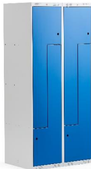
Clothes Z-locker, flat roof

This EPD applies to AJ Products clothes Z-locker, 2-section. High-quality clothes lockers with a welded steel frame, power coated with blue, grey or black doors. The 2-sections are available with sloping or flat roof also as a combo locker with two doors for one person with sloping roof. These lockers are highly adaptable to pair with other sizes and combinations to fit your needs and preferences. The steel-plate lockers are perfect for storing clothes and personal belongings in workplaces, gyms, schools, exhibition rooms and other public areas.