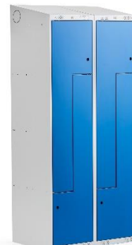
Clothes Z-locker, sloping roof