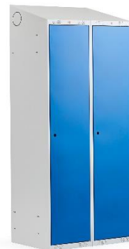
Clothes locker, sloping roof