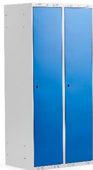
Clothes locker, flat roof

This EPD applies to AJ Products clothes locker Classic, 2-section. High-quality clothes lockers with a welded steel frame, power coated with blue, grey or black doors. The 2-sections are available with sloping or flat roof also as a combo locker with two doors for one person with sloping roof. These lockers are highly adaptable to pair with other sizes and combinations to fit your needs and preferences. The steel-plate lockers are perfect for storing clothes and personal belongings in workplaces, gyms, schools, exhibition rooms and other public areas.