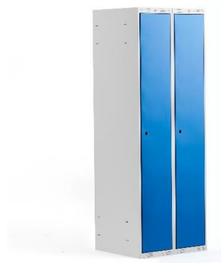
Clothes locker, flat roof

This EPD applies to AJ Products clothes locker Classic, 2-section. High-quality clothes lockers with a welded steel frame, power coated with blue, grey or black doors. The 2-sections are available with sloping or flat roof also as a combo locker with two doors for one person with sloping roof. These lockers are highly adaptable to pair with other sizes and combinations to fit your needs and preferences. The steel-plate lockers are perfect for storing clothes and personal belongings in workplaces, gyms, schools, exhibition rooms and other public areas.