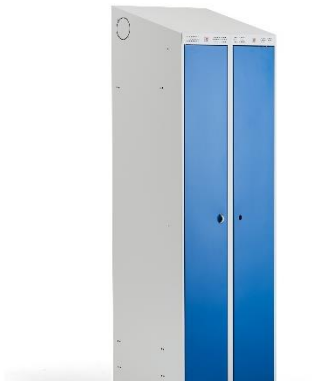
Combo locker, sloping roof