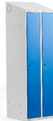
Clothes locker, sloping roof